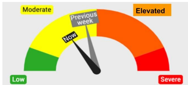
Elkhorn Logan Valley Public Health Department Covid-19 Risk Dial Example

Norfolk Public Schools (NPS) has drafted a comprehensive Return To School Plan based upon the 4-tier colored risk dial developed by the Elkhorn Logan Valley Public Health Department (ELVPHD). Coordinating efforts with them will enable the school district to respond quickly when there is a change in covid status within the community. NPS will be evaluating the situation on a weekly basis in conjunction with ELVPHD. As this pandemic changes, these protocols are also subject to change.